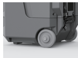
Heavy-Duty Rubber Wheels