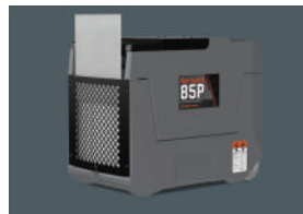
Easy Filter Access