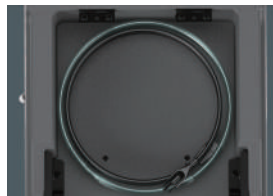
Easy Cord and Hose Storage