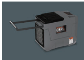
Fold-Down with Wheels for Transport