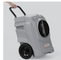
Durable wheels ensure portable ease