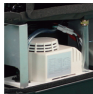
Heavy-duty condensate pump