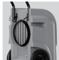
Removable MERV-8 Filter