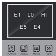
Auto Error Detection