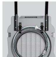
Convenient storage for power cord and drain hose