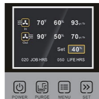
Smart LCD Display Panel